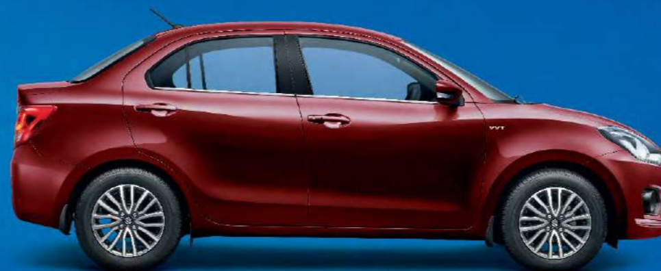
Gallant Red Vibrant | Luminescent | Audacious