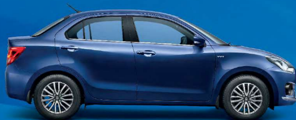
Oxford Blue Mature | Rich | Serene

Everyone is unique and so is everyone's Dzire. That is why the whole new Dzire comes in six gorgeous shades. Pick one and let the world know that you have arrived.