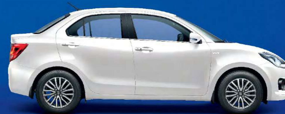
Pearl Arctic White Pristine | Sophisticated | Lucid