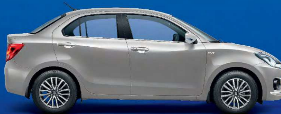
Silky Silver Futuristic | Modern | Awe-inspiring