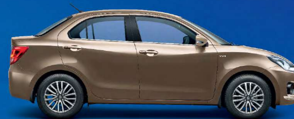
Sherwood Brown Urbane | Organic | Harmonious