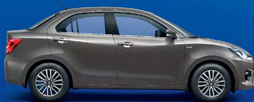
Magma Grey Earnest | Compelling | Modest